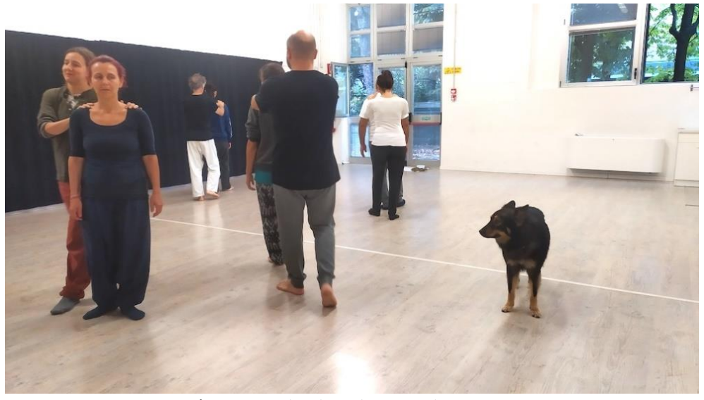
Figure 2 – The dog observes the actions (Photo credit: Marco Adda /AEDC Archive).

curiously explored the space and interacted with the main activity, such as observing the action from a close distance (Figure 2), entering the room between people (Figure 3), and occupying a specific spot in the studio (Figure 4).