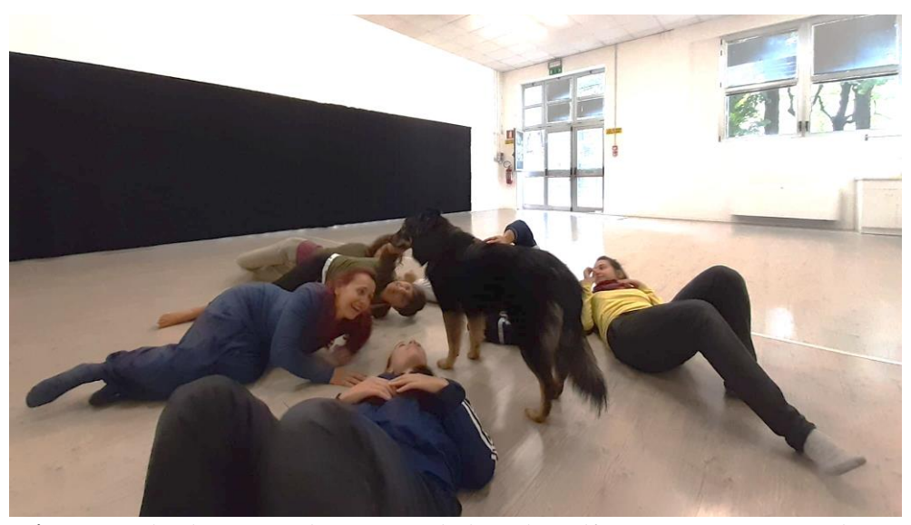
Figure 3 – The dog enters the space and places herself among participants.