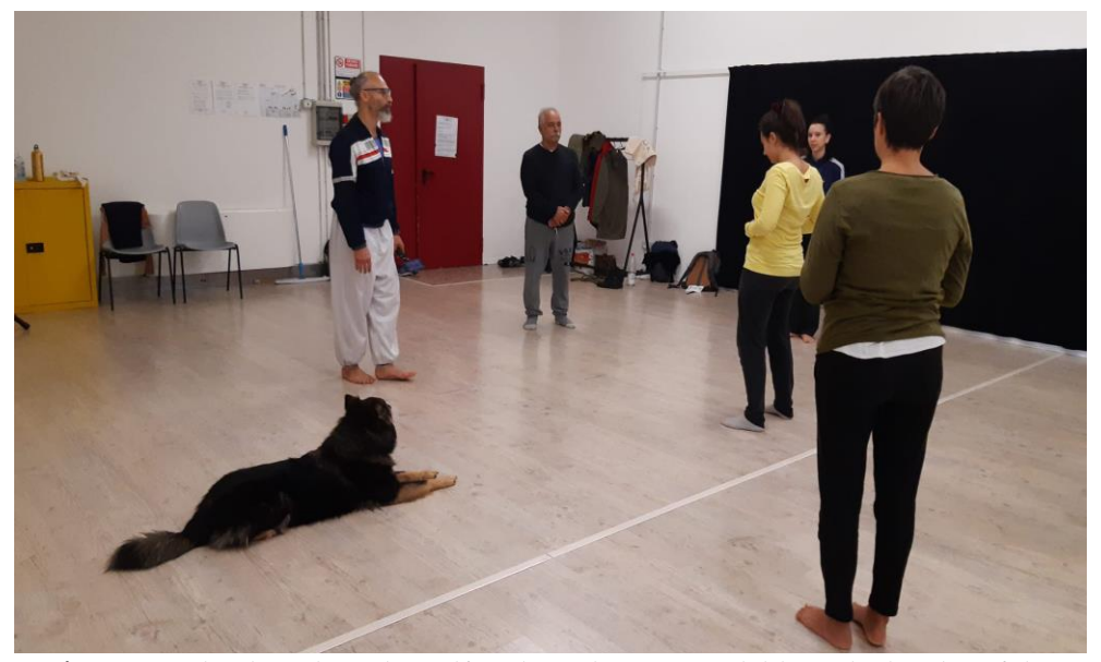
Figure 4 – The dog places herself in the only spot available at the border of the circle of people

The presence of another species – a dog, in this case, created an extra level of attention, and the practitioners' perception expanded. Her attendance brought particular energy during the work. In the context of somatic experience and bodymind training, the dog's presence facilitated emotional release. Crying, hugging, and other behaviours reflected relevant happening in the emotional expression of participants. In the case of Robin, she responded to the emotional release approaching every time people cry. What has been observed also is that the dog approaching a crying person triggered further emotional release and expression. Cecilia, a participant in the workshop, relates: